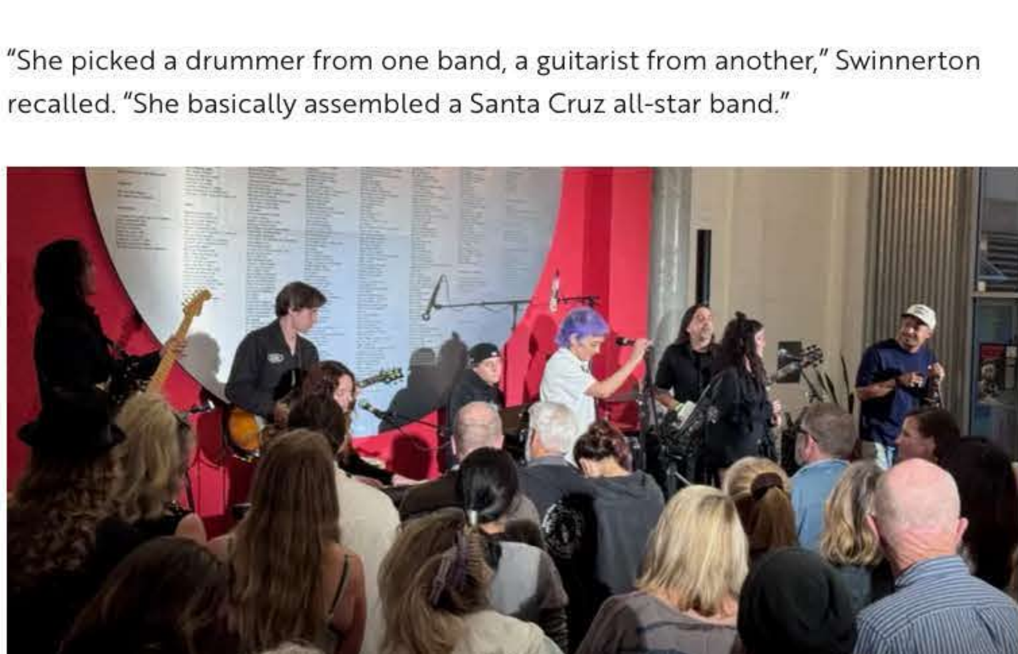
Jane Wiedlin of The Go-Go's performing with local musicians at the July 2025 "Legends: Live and Local" event at the Santa Cruz Museum of Art & History.